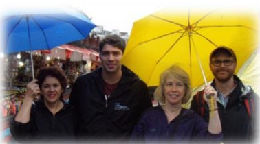
Visitors with their host family

We offer the Ibero's residences hall; it could be single or double occupancy; the hall named Villa Ibero has a cafeteria and kitchen facilities. You can also live at a hotel but we highly recommend you to live with a Mexican family to experience a total immersion. As soon as we receive your application, we will process the request for a room at the residences, hotel or placement in a family.